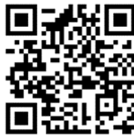
Diploma of Spiritual Direction